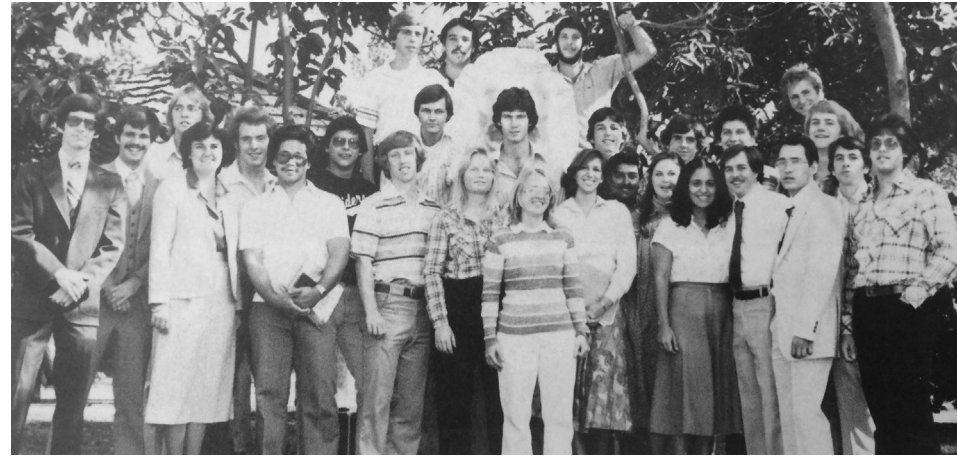
1980 Accounting Society